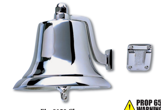
Fig. 0150 Chrome