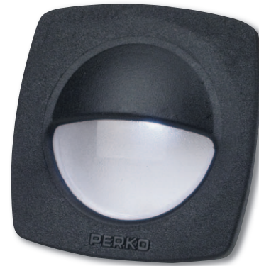
Fig. 1044 Black