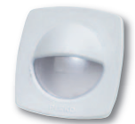
Fig. 1074 LED White