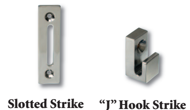
Slotted Strike "J" Hook Strike

Slotted Strike: 074000299A Hook Strike: 074000199A