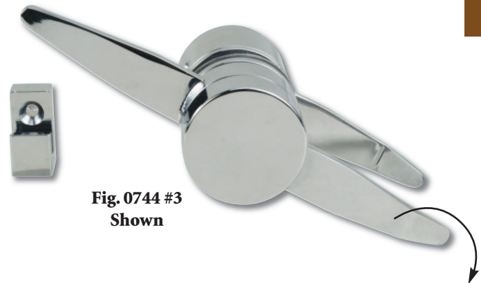
Fig. 0744 #3 Shown