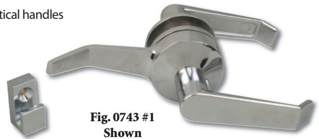
Fig. 0743 #1 Shown