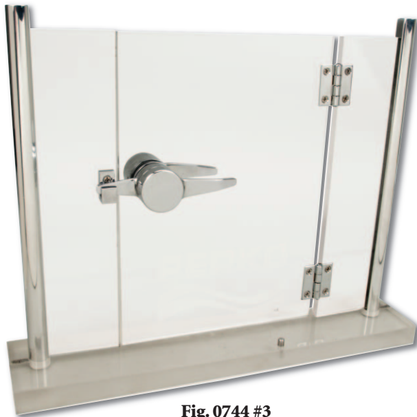
Fig. 0744 #3 Shown Mounted