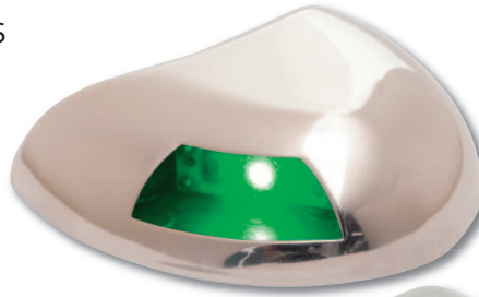
STEALTH II Series Fig. 0616 Stainless

Material: Stainless Steel Finish: Polished, Black, or White Powder Coated Dimensions: Length: 2-1/2", Width: 2-5/8", Height: 5/8" Screw Size: #8 Voltage: 12V LED Wattage: 3.75 watts (each light) Amperage: <0.25 amps (each light) Features: Ultra Low Profile, Low Heat, Long Life