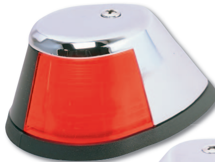
Fig. 0253 Chrome

Material: Bronze Top with Polymer Base or All Polymer Finish: Chrome Plated, Black, or White Dimensions: Length: 3-1/2", Width: 2-1/4", Height: 1-5/8" Screw Size: #8 Contacts: Gold Plated Voltage: 12V (Bulb Included) Wattage: 10 watts (each light) Amperage: .80 amps (each light)